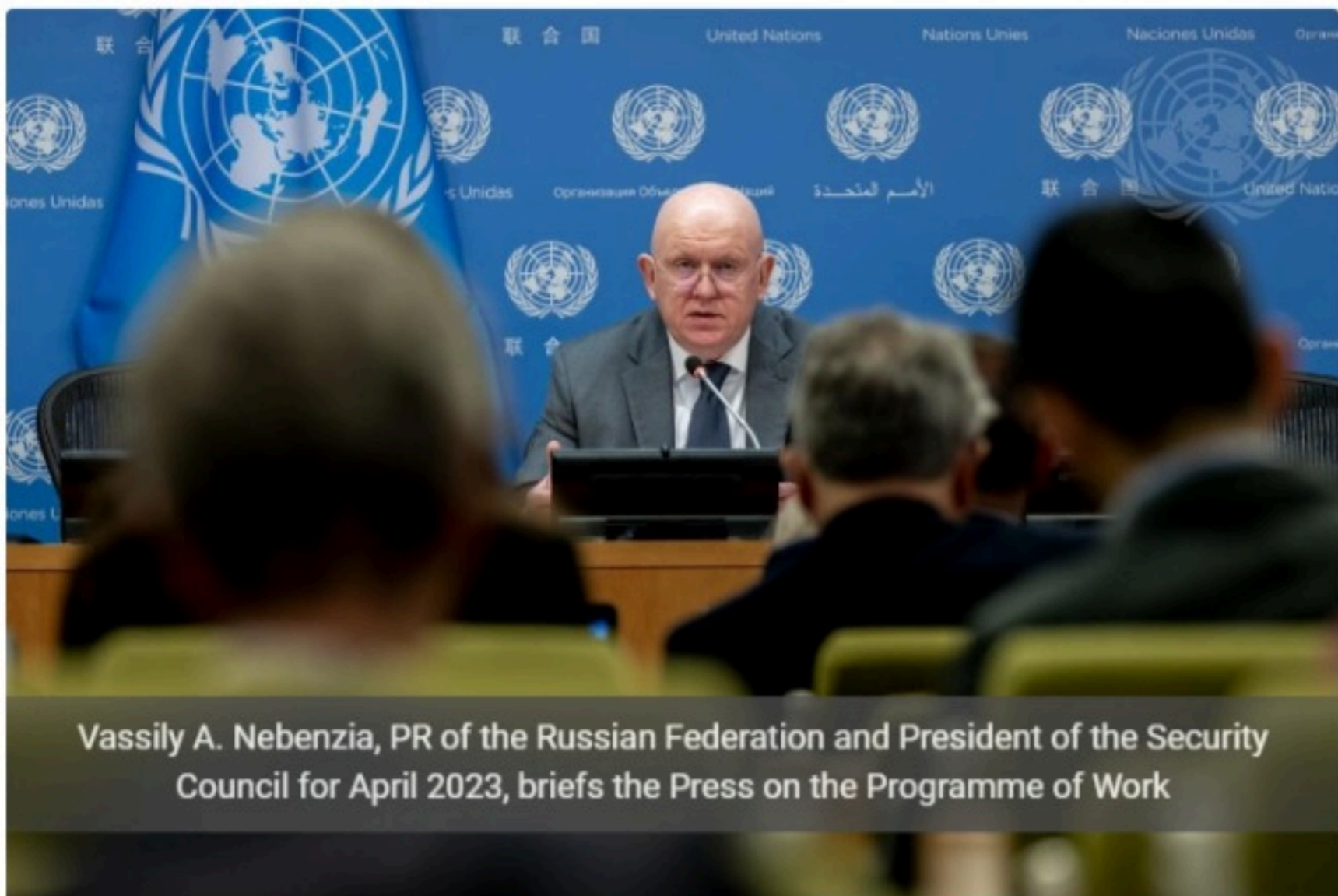
Vassily A. Nebenzia, PR of the Russian Federation and President of the Security Council for April 2023, briefs the Press on the Programme of Work